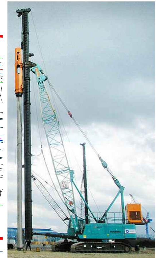
MOBILE PILING RIG